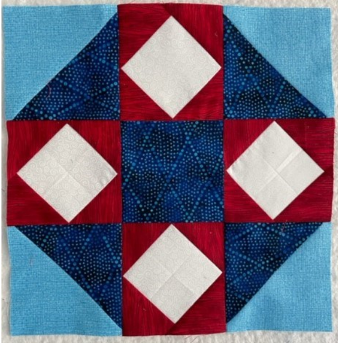
Raspberry Cheesecake BOM done in Reds, Whites and Blues