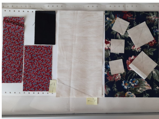
Photo #4 Sew the heel to the foot and the background to the leg leather. Then sew those two sections together and your boot is finished.

Photo #3 Cut off excess on background. Press print down. Use your 5" ruler to trim the background rectangle with shoe leather back to 5" by 9 5/8".