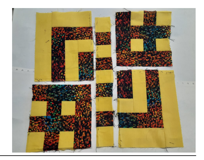
5 | G R A N B U R Y Q U I L T E R S' G U I L D